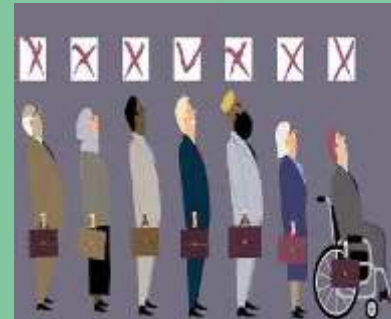
The teaching process